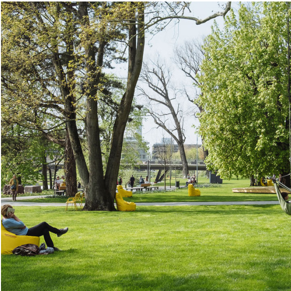
Enclosed lawns & play areas for children to gather

The development and enhancement of the park will help to cement it as a key community asset and one to be enjoyed for many years to come.