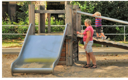
SLIDE AND PLATFORM