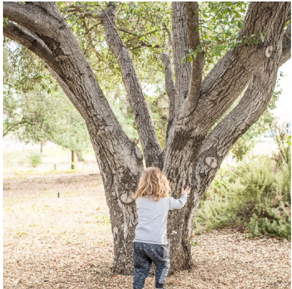
Enhance and retain existing green assets within the site

A safe, well-vegetated play space for all ages that which encourages play, wellbeing and a sense of community