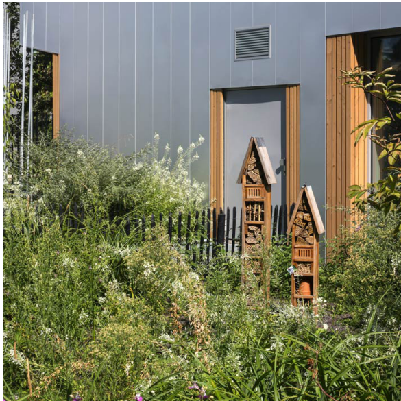
Enhanced planting with ecological interventions