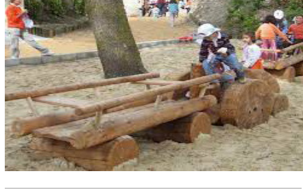
TRAILOR FOR TRACTOR