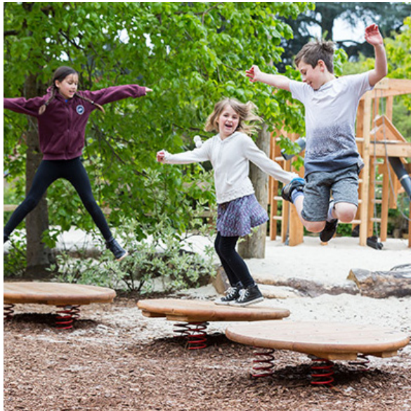
Playspace for younger residents