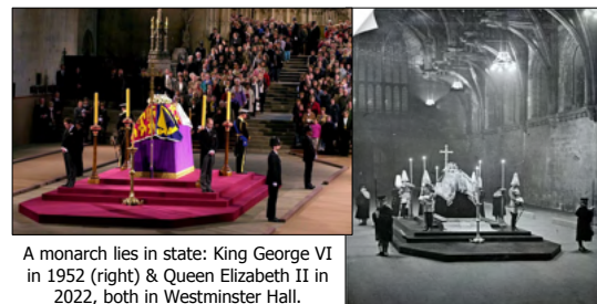
A monarch lies in state: King George VI in 1952 (right) & Queen Elizabeth II in 2022, both in Westminster Hall.

As in 1952, 2022 saw crowds pour into central London, some queuing for hours to pay their respects at the late monarch's coffin, others to catch a glimpse of the funeral procession. However, while the time-honoured formalities and ceremonies of a monarch's passing remain largely unchanged, the crowds watching them look quite different.