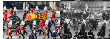
The funeral procession of King George VI in 1952 (above right) & that of Queen Elizabeth II, 2022

Now Queen Elizabeth, too, has passed and the Carolean age is upon us, with all the changes that will bring. What hasn't changed is the sense of history made — and the British people's desire to be a part of it. As the nation mourns the passing of Queen Elizabeth, Britain's longest serving monarch, we also look to the future. Long live the King.