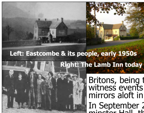
Left: Eastcombe & its people, early 1950s