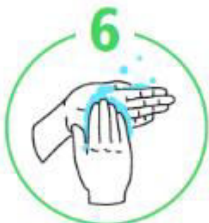
The tips of the fingers

Use a tissue to turn off the tap. Dry hands thoroughly.