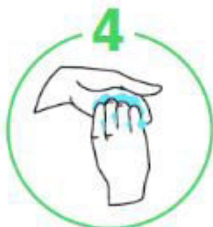
The back of the fingers