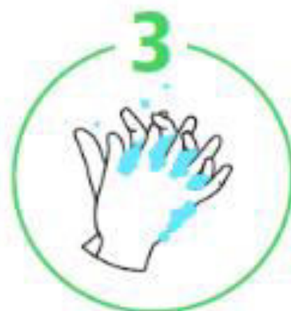
In between the fingers