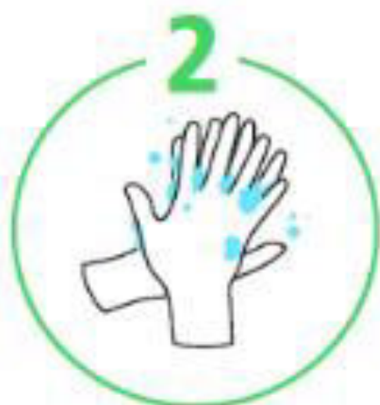
The backs of hands